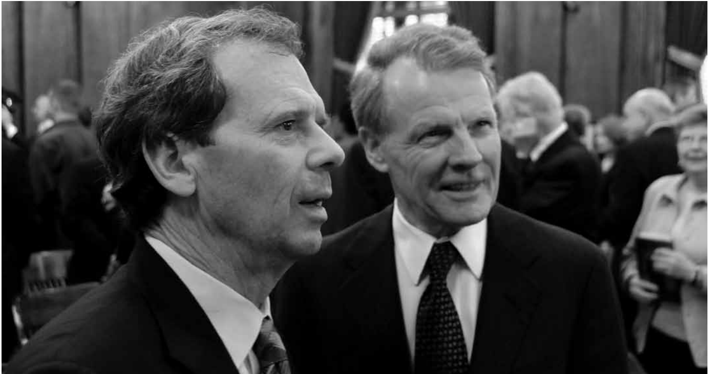
Illinois Senate President John Cullerton and House Speaker Michael Madigan helped create the Illinois Supreme Court Historic Preservation Commission and attended the March 9 unveiling ceremony.