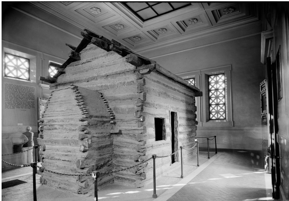
This 1940 photo shows a reconstructed cabin that symbolizes the one Lincoln was born in. The cabin is located inside a memorial at the Abraham Lincoln Birthplace National Historic Site in Hodgenville, Kentucky.