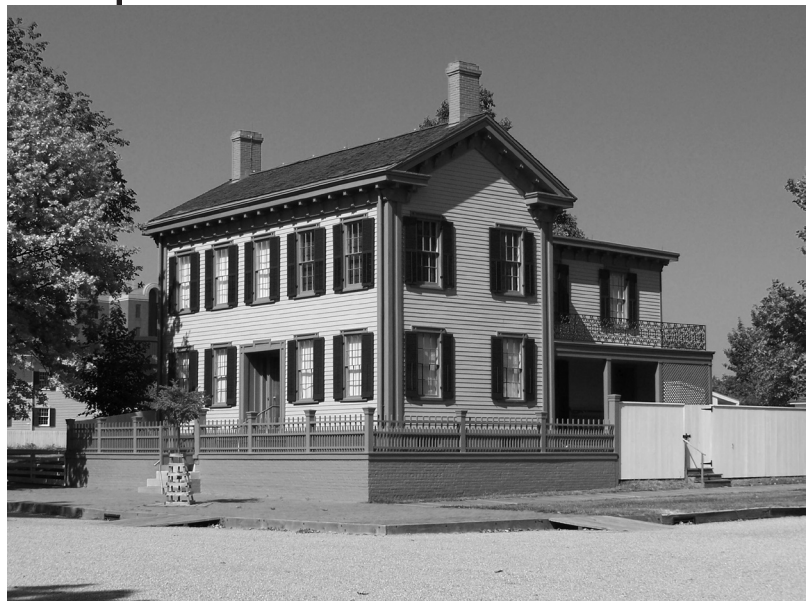
Abraham Lincoln, his wife, and their children lived in this Springfield, Illinois home from 1844 until they left for the White House in 1861.

"Abe," a new musical about Lincoln's life between his late teenage years and his departure from