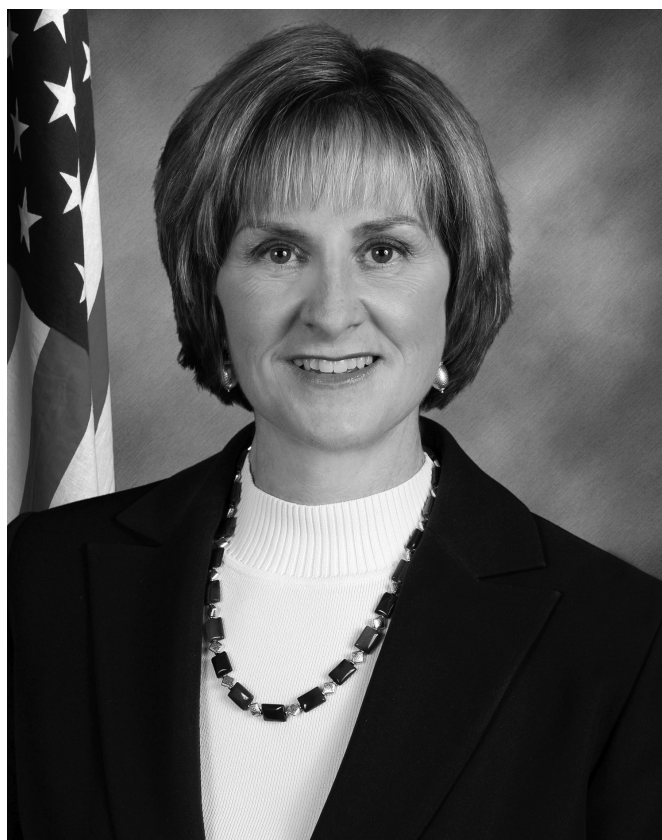
Senate Minority Leader Christine Radogno.