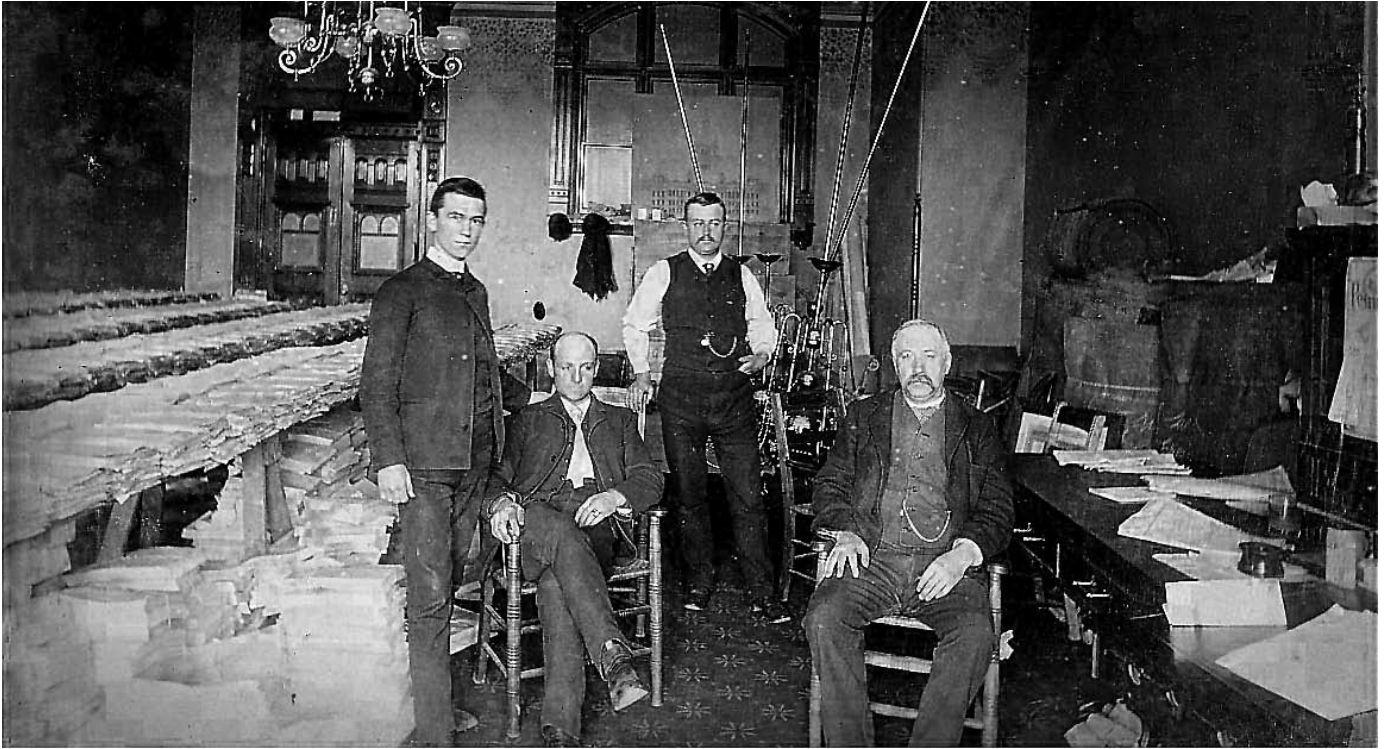
This photo shows the newly refurbished Room 114, which was recently expanded into a larger House committee room. Sorensen says the camera is facing east. “We have no documentation as to the use of the room early on, but it clearly looks like it was used to organize bills and for storage. In November 1908 it became the John A. Logan War Museum and stayed such until 1923 when it most likely reverted to a shipping room until the 1960s. A 1905 newspaper article referred to it as the ‘shipping room.’ ” (Learn more about the room’s recent renovation and its use as the Logan Museum at www.ilstatehouse.com .)