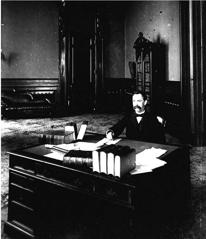
George Hunt, the 1887 Illinois Attorney General is pictured here. Sorensen says that this office was most likely located on the west side of the second floor, just west of the men's rest room. That's where the Attorney General definitely had a suite of offices by 1901. The Attorney General moved offices out of the Capitol 30 years ago.