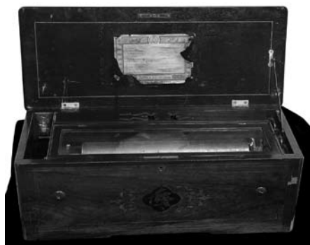
Mary's music box.