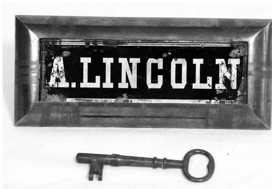
The Lincoln Home name plate and key are part of the Abraham Lincoln Presidential Library and Museum's extensive Lincoln Collection.