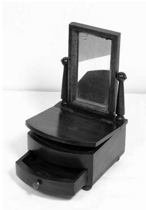
Mary Lincoln's jewelry box.

“There’s one item I can’t tell you about, that we learned of about two to three months ago, that I think could well be the real thing and it would be a fabulous real thing to have. We’re not sure that we’ll find out really. It falls into that category of partially documented, like almost everything does,” he says.