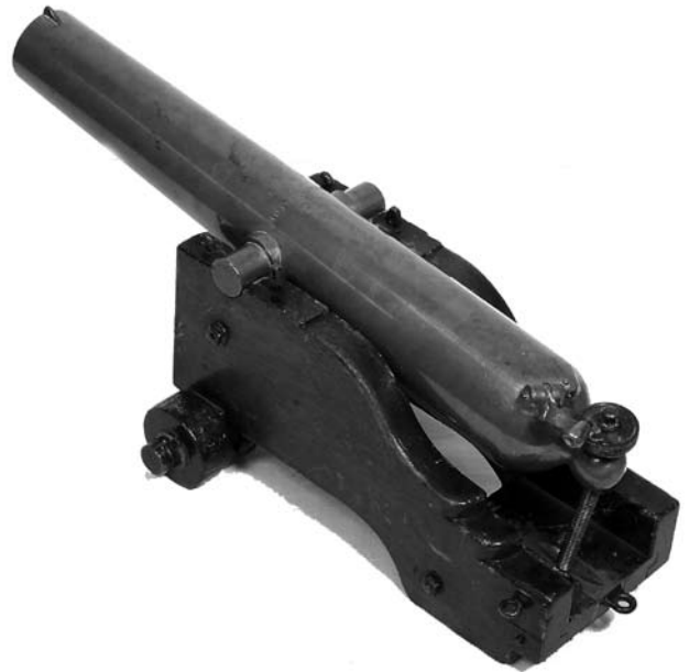
Tad Lincoln's toy cannon.

rent testing methods destroy too much of the artifact, but technology is evolving so that one day only a negligible fraction will be destroyed. Even then, historians will have to weigh the ethical implications of DNA testing, Cornelius says, because it could be seen as an invasion of the Lincolns' privacy.