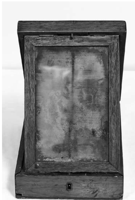
Abraham Lincoln's cracked shaving mirror.