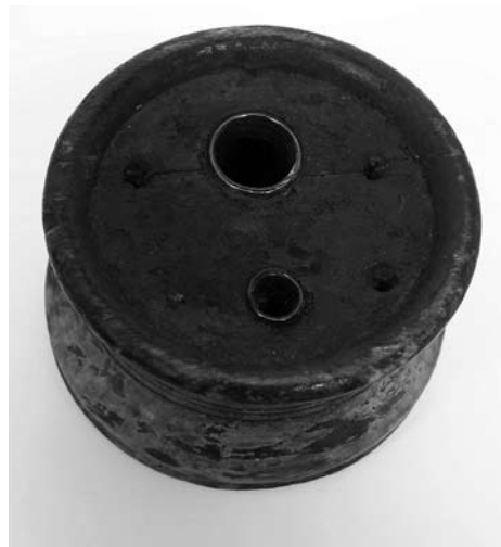
The inkwell Lincoln used to write his First Inaugural Address.