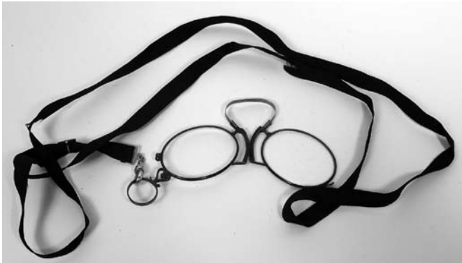
Abraham Lincoln's reading glasses

about things... There are several other people who hear about things and call us," he says.