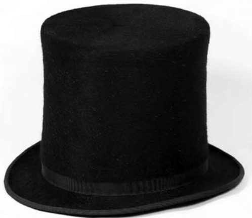
Lincoln's stovepipe hat.