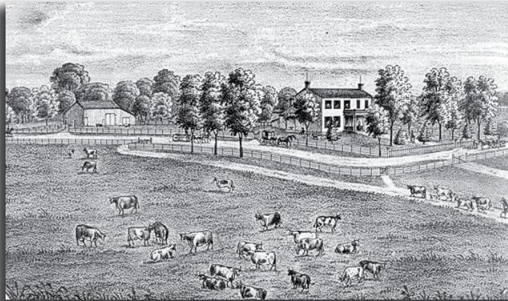
This is an old illustration of Woodlawn Farm, from the Atlas Map of Morgan County, 1872.