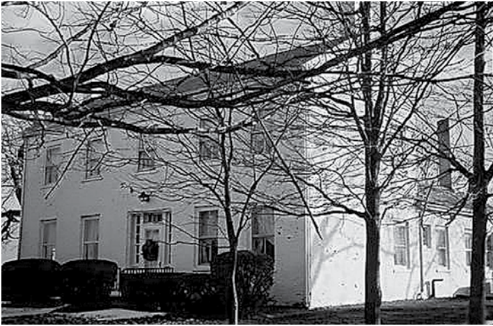
Woodlawn Farm's house as it appears today.