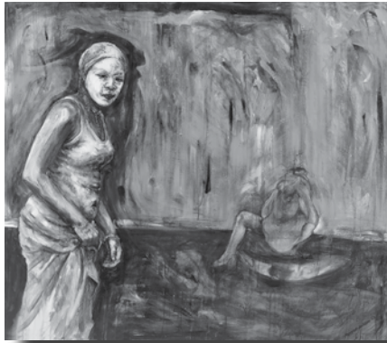
"The Glimpsing," 2003.