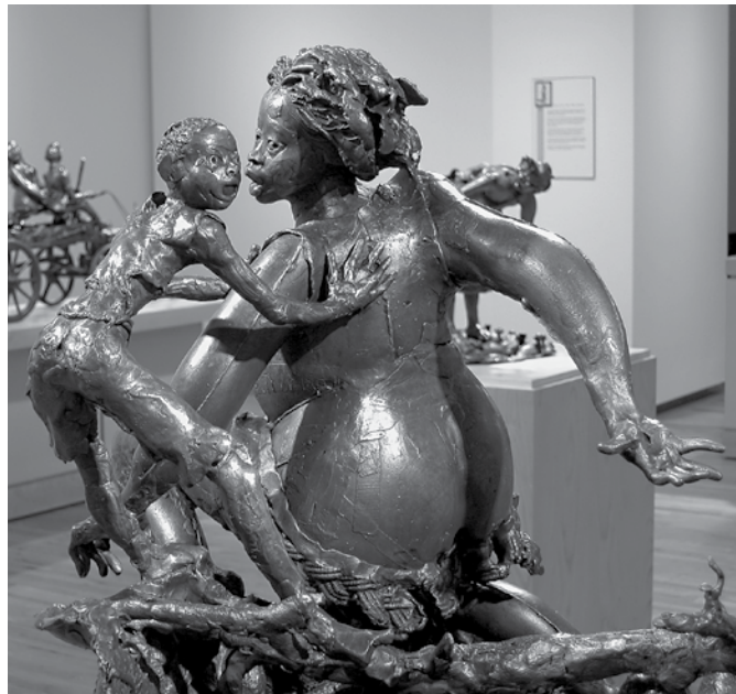
A close-up of "Peanut and Momma's Escape," 2005, bronze.