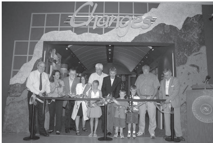
Grand opening ribbon cutting, June 12, 2004

For those people nostalgic for the dioramas from the old natural history hall, they won’t be as some have been reintroduced in refurbished and updated dioramas of diverse landscapes found throughout Illinois. Examples include the central prairie of McLean County, the northwestern forest, the Cache River Swamp, and the northeastern beach shrubland along Lake Michigan. Using studies based on geology, ecology, archaeology, and historic records such as land surveys to assemble the dioramas, the landscapes reveal how these places might have looked in 1673. The Museum’s famous mastodont skeleton