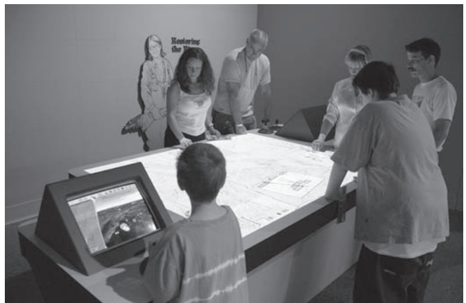
Digital River Basin

The new natural history exhibit includes the RiverWeb Digital River Basin that allows people to explore a twenty-mile stretch of the Illinois River Valley using computer simulations based on real data. Funded by a grant from the National Science Foundation, the RiverWeb Digital River Basin may not sound exciting, but the hands-on, interactive exhibit actually resembles something straight out of