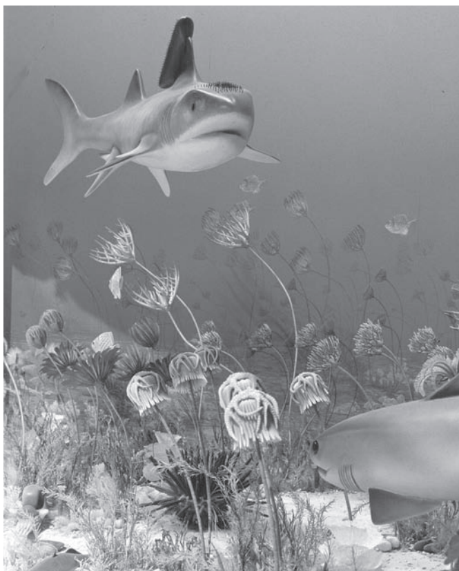
Mississippian Tropical Sea Covering Illinois 340 million years ago

Rather than being spoon fed information, the technological and interpretive elements of Changes challenge visitors to actively participate in the experience. That experience includes not only what our physical environment looked like at different stages over the last 500 million years from the time Illinois was covered by a shallow sea located south of the equator to the