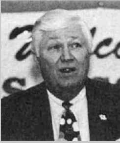
Senator James "Pate" Phillip